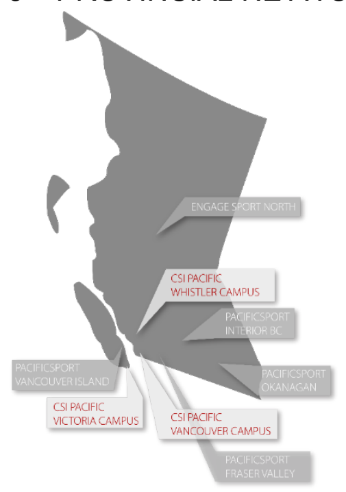
Figure 2 – Provincial Network Map Through a partnership with the Province of British Columbia, Team BC, and viaSport, CSI Pacific and the network of PacificSport centres collaborate to deliver programs and services to support the full continuum of sport development from participation to excellence. The centres work jointly to encourage growth in sport participation at the grassroots level and increased podium performances in communities throughout BC.

Working in support of national, provincial, and regional sport partners, the network is creating a stronger system for the development of athletes, coaches, and performance enhancement for teams and facilities. Targeted athletes and coaches in BC have access to five regional centres and three CSI Pacific locations allowing for localized support through high performance benefits, programs, and services.